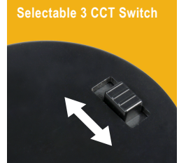
Selectable 3 CCT Switch