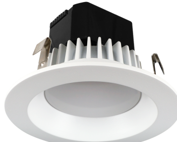
120-277V 0-10V Dimming Ver.