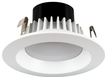
120V Triac Dimming Ver.

Use the switch to set the desired CCT (Correlated Color Temperature).