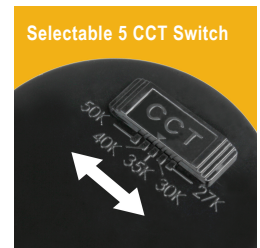
Selectable 5 CCT Switch